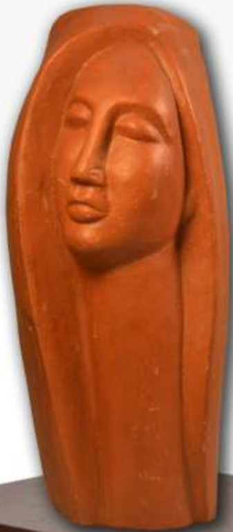
Flower vase lady S: 6 x 4 inch Code: HD125 RCH: Panchmura