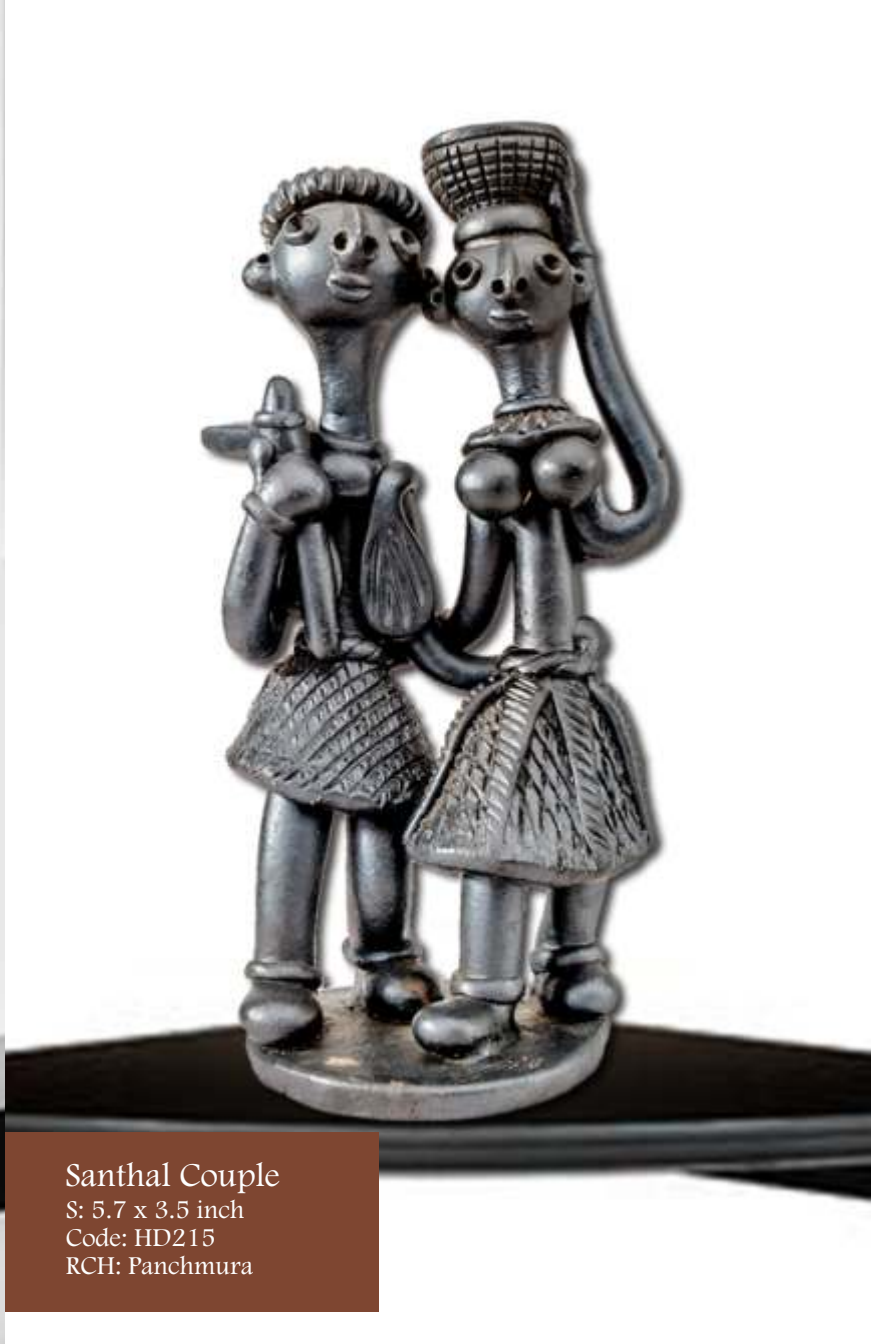
Santhal Couple S: 5.7 x 3.5 inch Code: HD215 RCH: Panchmura