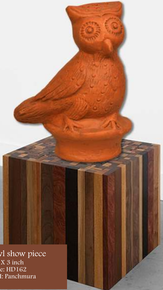
Owl show piece