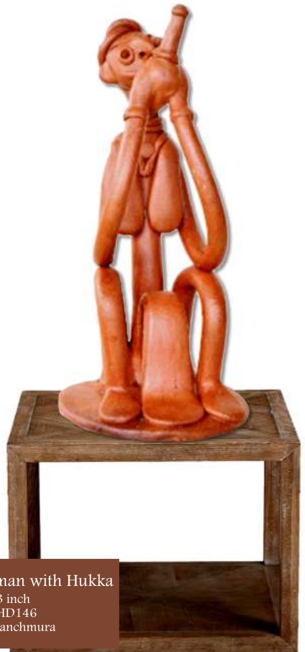
Old man with Hukka

S: 8 x 3 inch Code: HD213 RCH: Panchmura