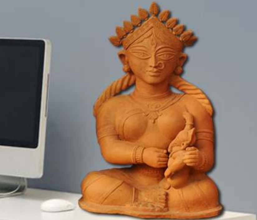
Durga ~ Ganesh show piece