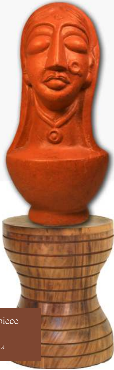
Lady show piece

S: 5 x 3 inch Code: Hd142 RCH: Panchmura