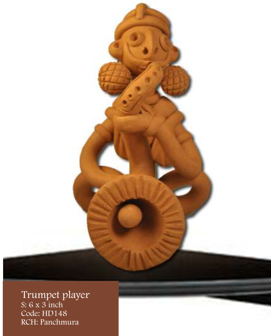
Trumpet player S: 6 x 3 inch Code: HD148 RCH: Panchmura