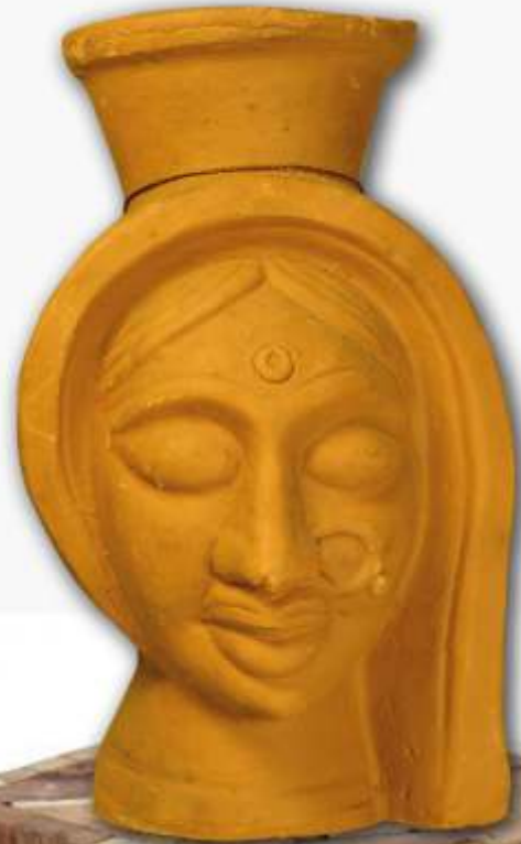
Face flower vase S: 6 x 5 inch Code: HD139 RCH: Panchmura