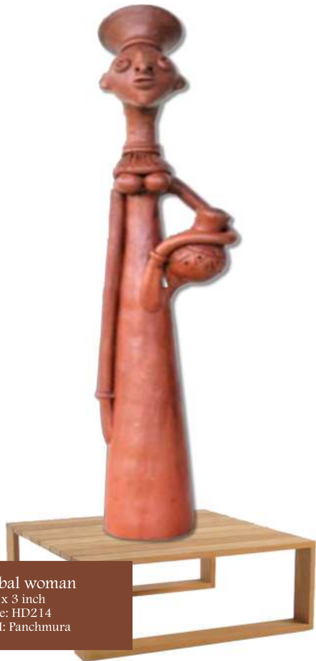
Tribal woman S: 8 x 3 inch Code: HD214 RCH: Panchmura