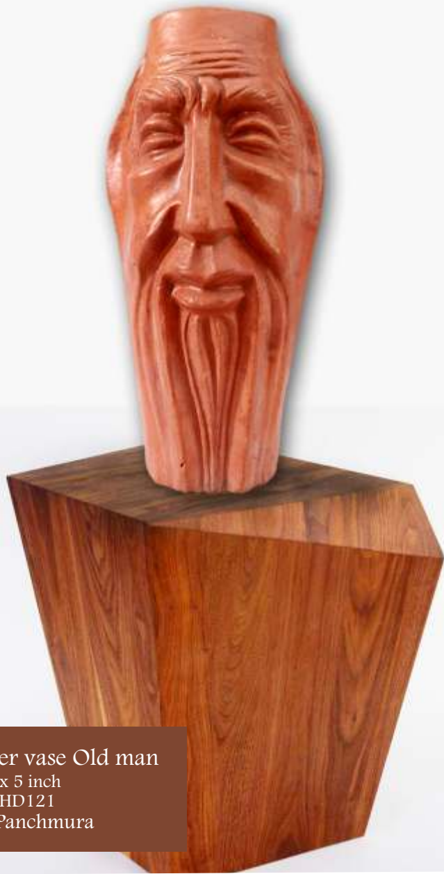
Flower vase Old man S: 9.4 x 5 inch Code: HD121 RCH: Panchmura