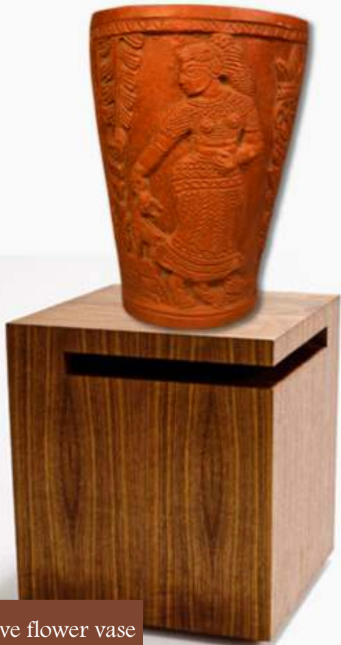
Figurative flower vase S: 12 inch Code: HD161 RCH: Panchmura