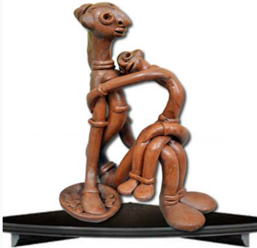
Mother with child S: 8 x 3 inch Code: HD212 RCH: Panchmura