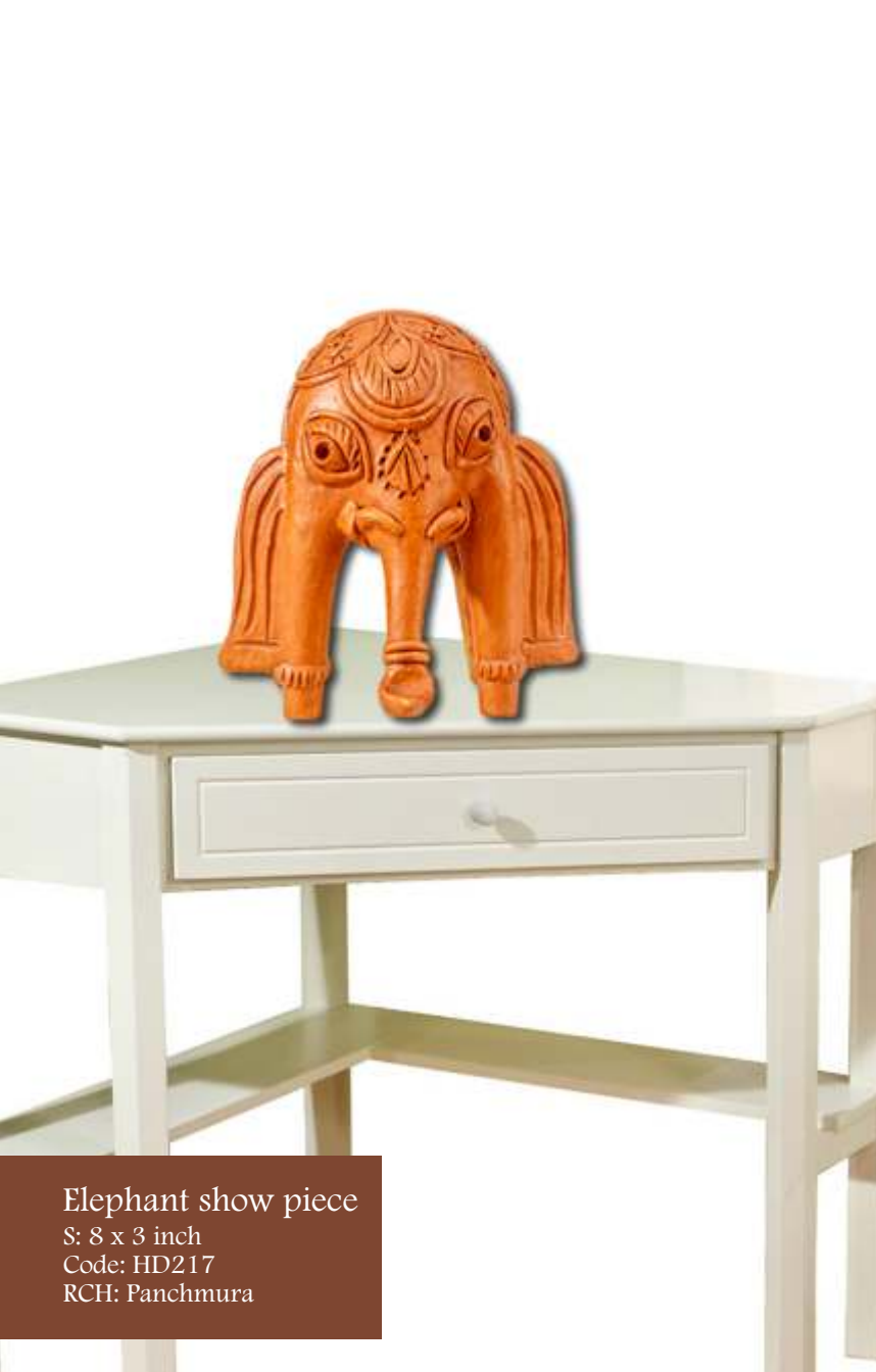
Elephant show piece

S: 8 x 3 inch Code: HD217 RCH: Panchmura