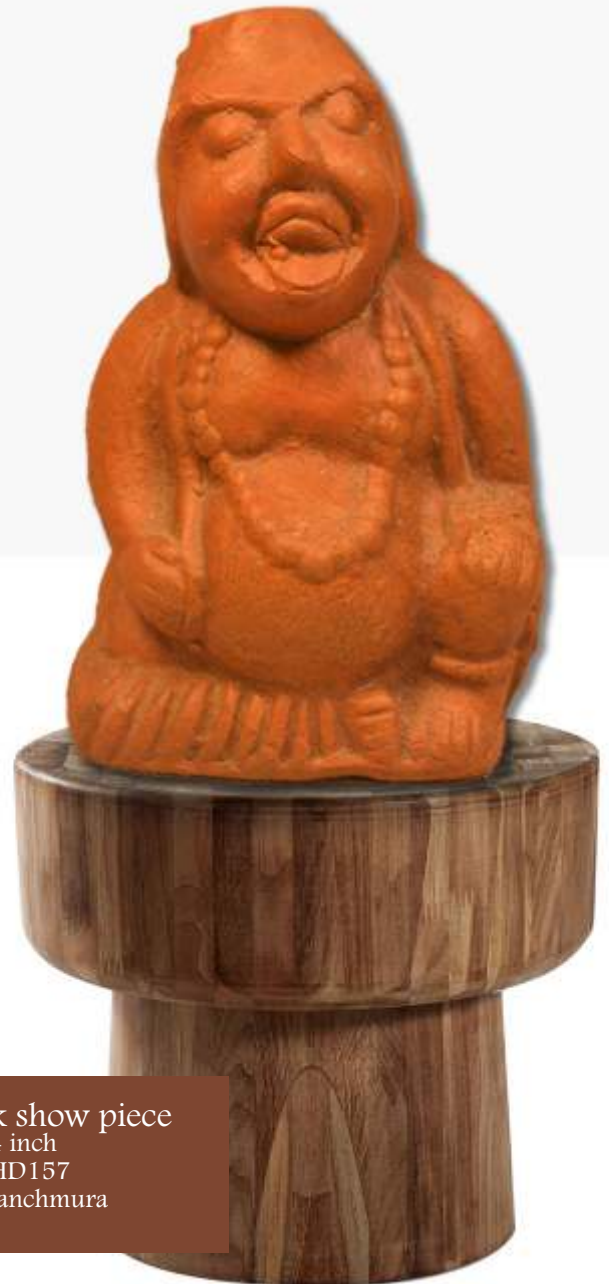
Monk show piece S: 6 x 4 inch Code: HD 157 RCH: Panchmura