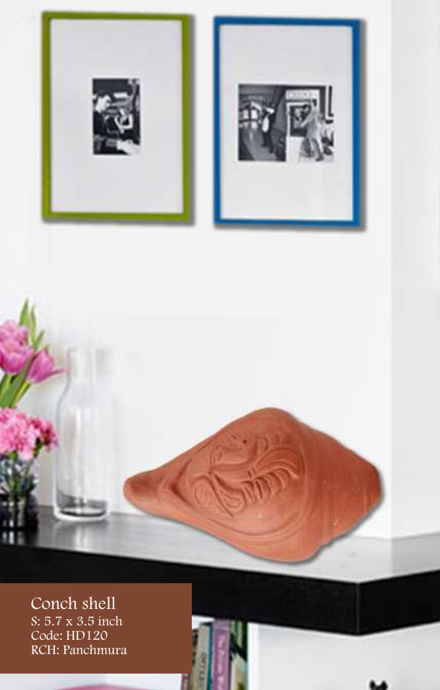
Conch shell S: 5.7 x 3.5 inch Code: HD120 RCH: Panchmura