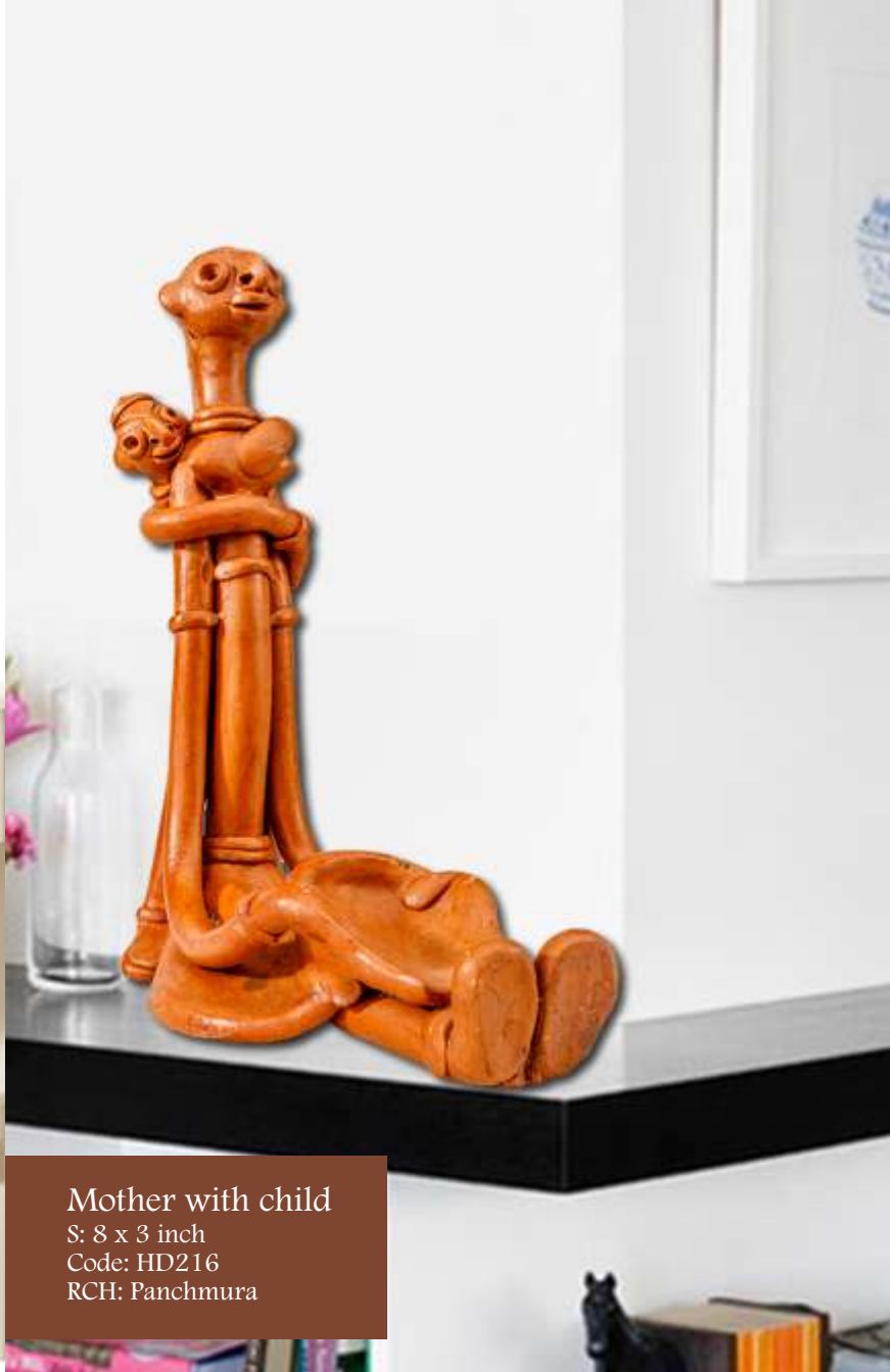
Mother with child

S: 8 x 3 inch Code: HD217 RCH: Panchmura