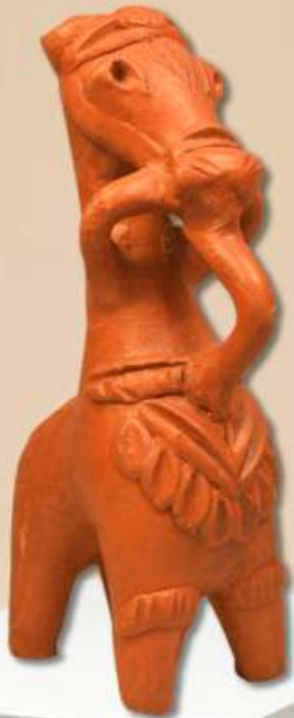
Horse show piece S: 4 x 3 inch Code: HD 160 RCH: Panchmura