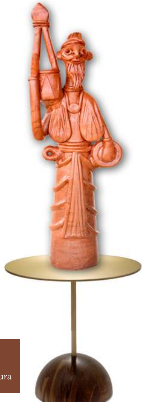
Baul S: 5.4 x 2.3 inch Code: HD124 RCH: Panchmura