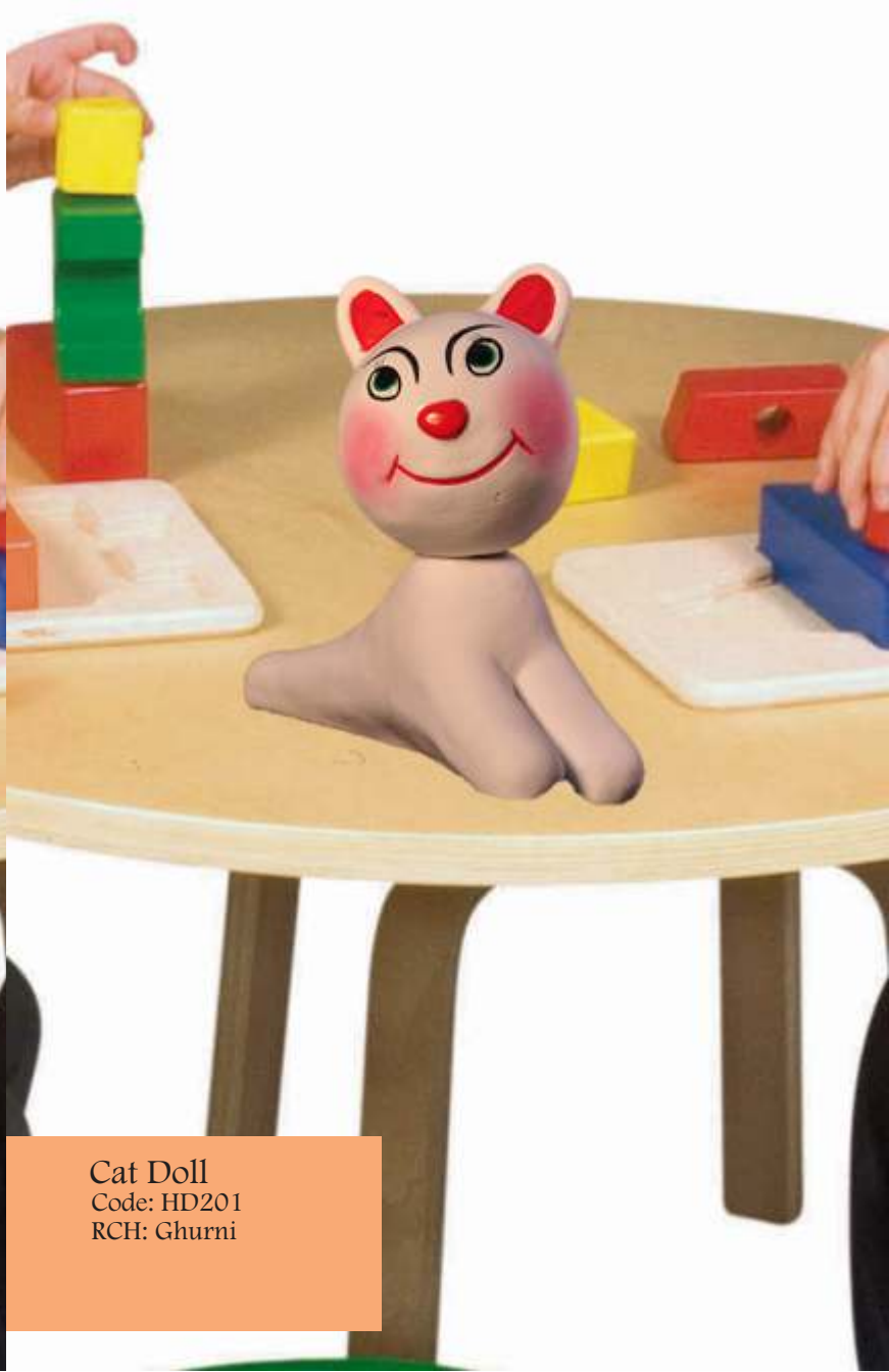
Cat Doll Code: HD201 RCH: Ghurni