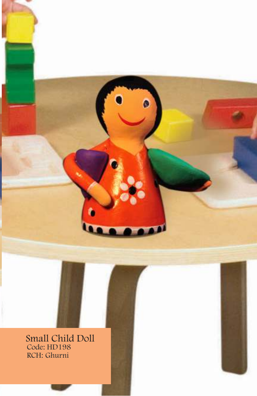
Small Child Doll Code: HD198 RCH: Ghurni