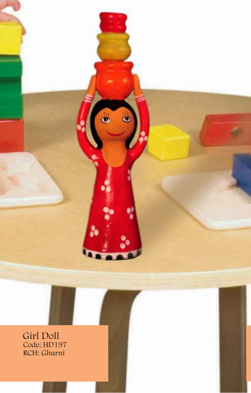
Girl Doll Code: HD197 RCH: Ghurni