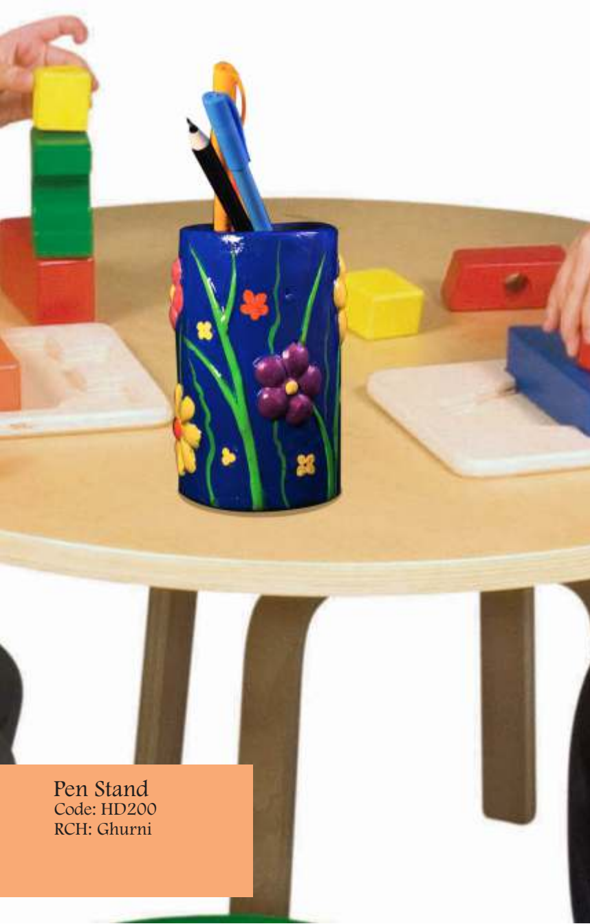
Pen Stand Code: HD200 RCH: Ghurni